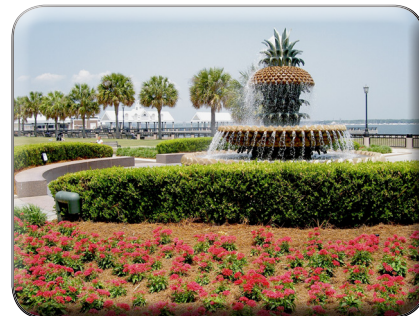
Waterfront Park.